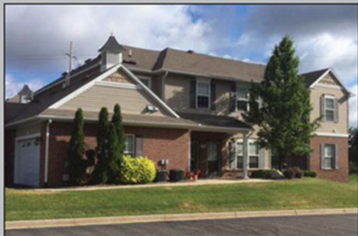
*picture of existing building for illustration purposes only. Actual building may vary.