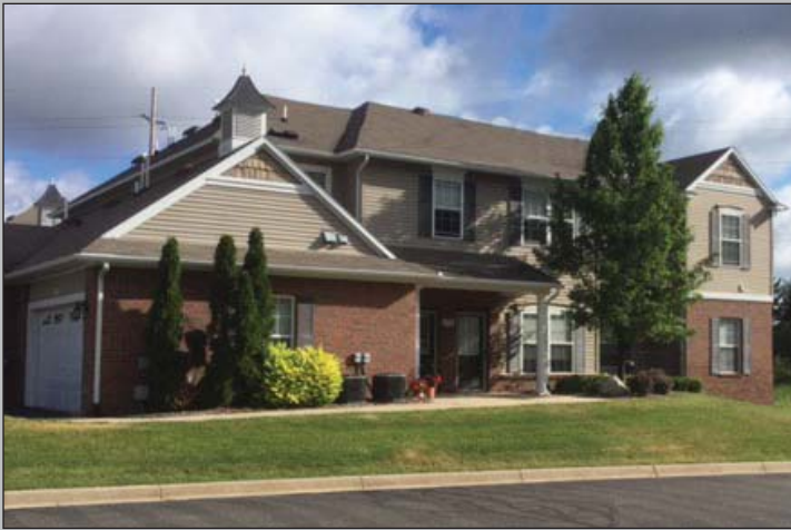
*picture of existing building for illustration purposes only, actual building may vary.